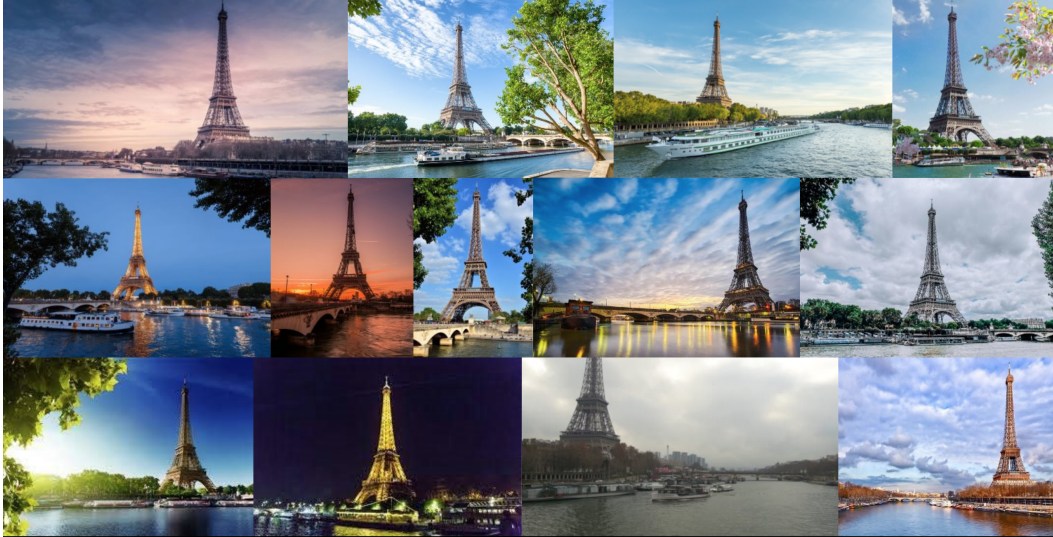
Figure 2: A variety of images of the Eiffel Tower and Seine river.

Although evaluating a single, large algorithm or network is easier from a testing infrastructure standpoint, it has significant disadvantages with respect to interpretability. This is a drawback for integrated systems like robots, since better models of performance have a positive feedback loop with respect to development by allowing more targeted algorithm improvements.